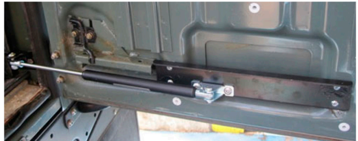
Images shows fitment to vehicles 2007 on (Puma), please note extra bracket required for fitment