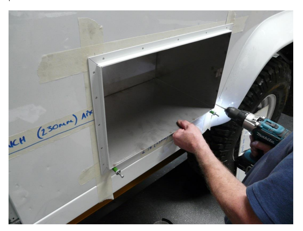
Some fitters like to use a small amount of bond between the mating surface's, should you wish to do the same please use a suitable bond compatible with all materials.