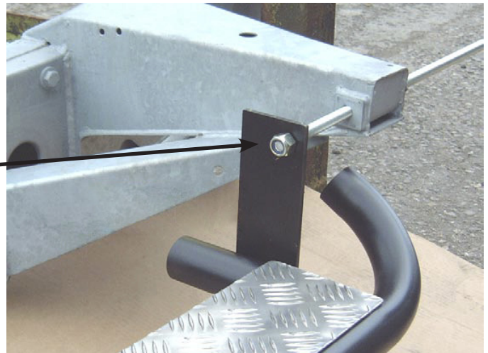
Bulkhead bolt and nut (1)

Front mounting – bulkhead is not on chassis shown.